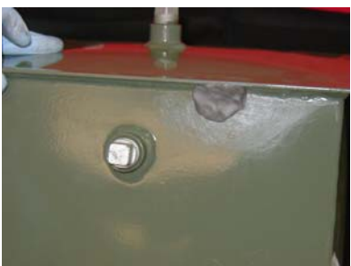
Apply putty ½ inch beyond leak; ⅛ to ¼ inch thick