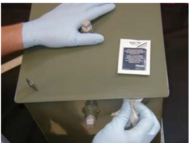
Clean area with Type TR™ before applying PowerPatch® Putty