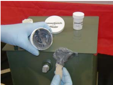
Apply PowerPatch® Sealant over putty patch or leak area