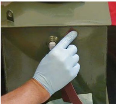
Sand or brush repair area