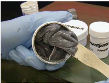
Mix 2-part paste sealant to a uniform grey color