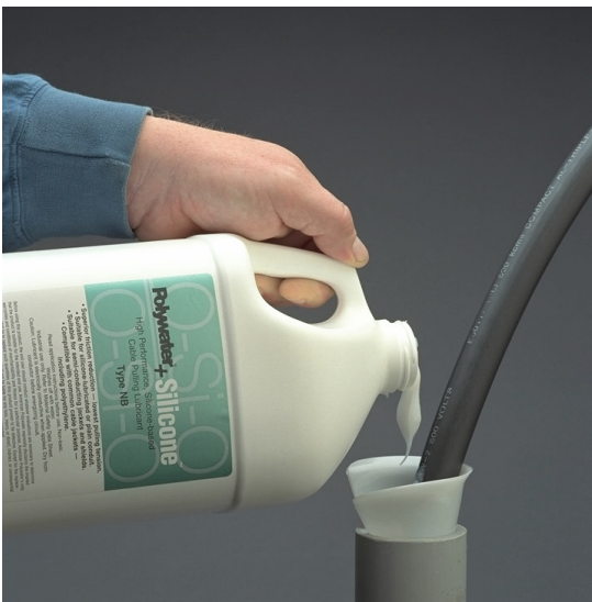
Semi-liquid lubricants can be poured or gravity fed into an applicator.

This thickness property of a liquid can be measured with a viscometer. Our definition of a liquid essentially includes materials with viscosities from 1 to 20,000 centipoise (cps). For example, water has a viscosity of 1 cps, while honey has a viscosity of 50,000 cps. Most commercially available "liquid" pulling lubricants are "thicker" liquids with viscosities from 1,000 to 15,000 centipoise.